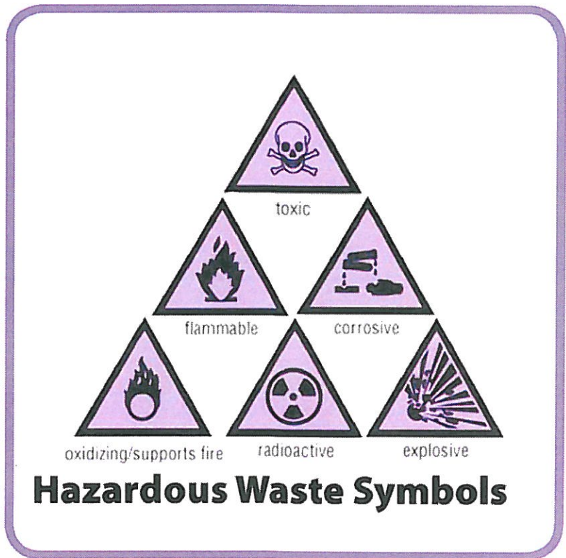
Hazardous Waste Symbols

Filter cake generated from on-site solvent recycling may be a listed hazardous waste. As the waste generator, you are responsible for determining if the filter cake is hazardous. See the section 'Hazardous Waste Determination' below for more information.